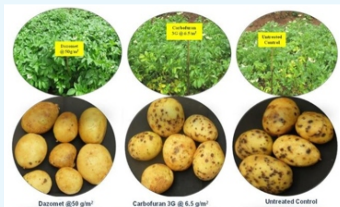
Effect of Basamid 90G on PCN (60 DAP) and tuber borne diseases (120 DAP)

Application of Carbofuran 3G @ 65 kg/ha at the time of planting is being recommended as a part of package of practices for the management of potato cyst nematode in Nilgiris, however it is not that much effective to control the PCN population. Therefore, in order to identify the alternate chemical, new soil fumigant molecule Basamid 90G was evaluated at ICAR-CPRS, Muthurai, Ooty with the susceptible variety Kufri Girdhari in pots as well as in field conditions with different doses viz., 20, 30, 40 and 50 gm/m 2 along with untreated control and Carbofuran. Among the treatments, pots applied with Basamid 90G@40 g/m 2 and recorded less