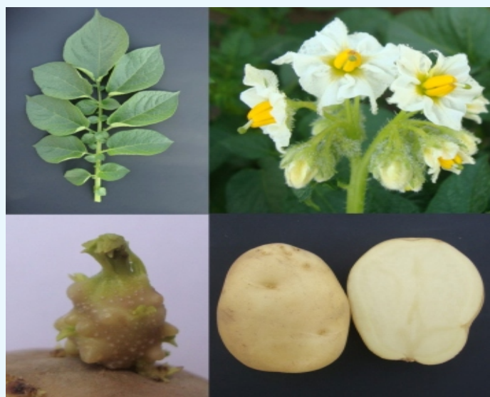
MS/10-1529-Leaf, flower, sprout and tubers

However at 90 days, MS/10-1529 with 46.26 t/ha total tuber yield revealed advantage of 35.99%, 7.97%, 7.89% and