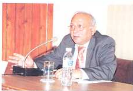
DDG (H) addressing the workshop participants

the challenges of 21 st century only if we are prepared. The research in agricultural sciences leading to Green Revolution has disproved the Malthusian Theory. Many other revolutions are also taking place. Science has made a lot of progress and a lot of information is generated in different fields. However, any science has got a cost factor. Therefore, the information generated should be utilized properly. Information technology plays an important role in bringing all the knowledge together. Like in some other branches of science, in communication also revolution has taken place and it has enhanced the efficiency of the uses of Information Technology (IT) to properly utilize the knowledge generated. Till the end of last century, IT knowledge was not managed properly and its proper use was lacking. Use of IT in ICAR system is rather new thus, this workshop was organized so that the scientists working on IT to get an opportunity to learn from the experiences of each other and explore the ways and means to augment the use of IT in agriculture and particularly horticulture.