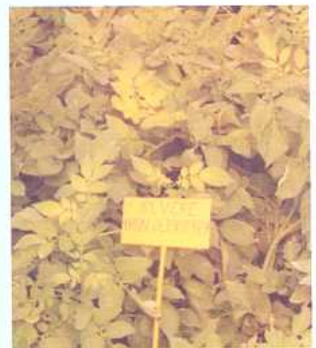
Plate 3. Iron deficiency symptoms in potato.

There is a resurgence of interest in organic farming globally, which holds sustainability of natural resources and environment supreme along with nutritional quality of produce. The profitability of organic farming depends, on the higher prices that its products command in the market place. Much severe mean tuber yield loss of 35.3% in organic farming compared to 100% mineral fertilizers treatment was recorded in initial 3 years result of a long term experiment