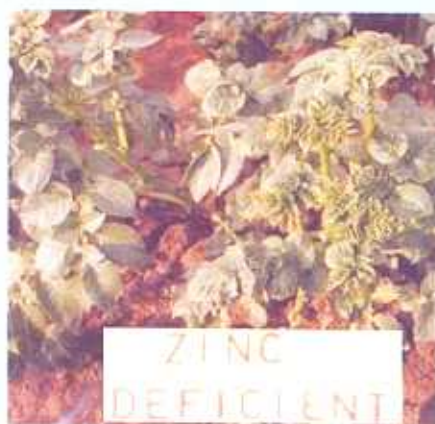
Plate 4. Zinc deficiency symptoms in potato