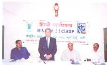
ऊटी में हिन्दी कार्यशाला