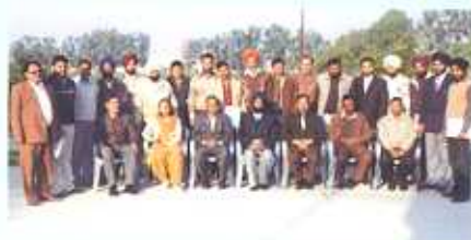
Trainees and faculty of the training programme

One day training programme on Potato seed production; Scientific potato cultivation and Late blight