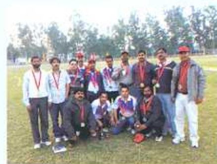
Winners of the inter-zonal sports team of CPRI

After winning ICAR Zonal Sport Tournament in Table Tennis, Badminton & Volleyball Shooting at IISR, Lucknow, CPRI contingent participated in ICAR Inter-Zonal Sports Meet at NDRI, Karnal and brought pride for CPRI by winning