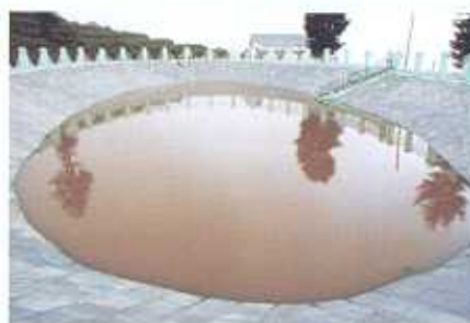
A view of water harvesting tank at Fagu

Field crop of seed potatoes is grown here during April–August