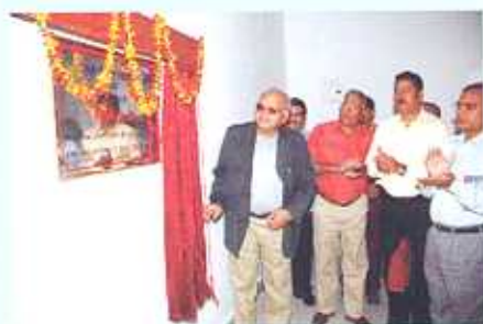
DDG (H) inaugurating the potato genome laboratory