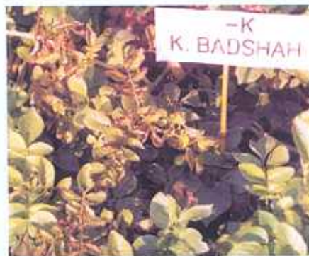
Plate 2. Potassium deficiency symptoms in potato.

potato growing soils have already accumulated medium to high available phosphorus and do not need full dose of phosphorus application each year. Use/Grow nutrient efficient potato cultivars like Kufri Pukhraj.