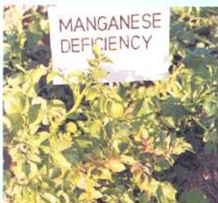
Plate 5. Manganese deficiency symptoms in potato