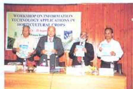
Release of publication during the workshop