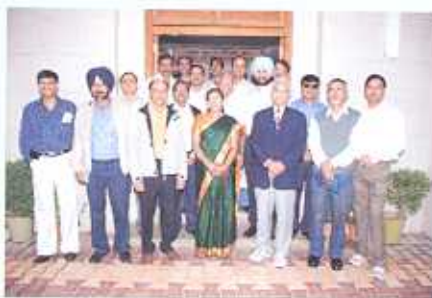
Participants of the CAC and CIC meeting

The third consortium advisory committee (CAC) and consortium implementation committee (CIC) meeting of NAIP sub-project "Value Chain on Potato and Potato Products" was held on 24 th July 2009 at CPRI, Shimla. The meeting was held to review the progress of the project and