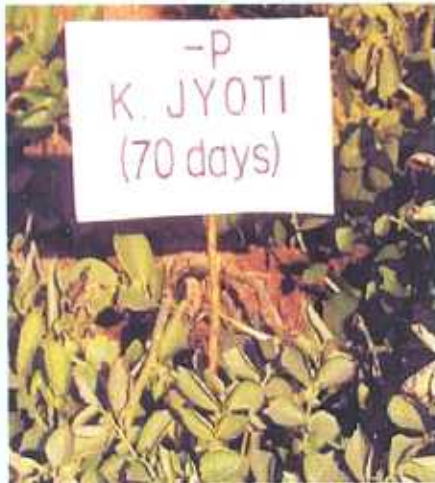
Plate 1. Phosphorus deficiency symptoms in potato.