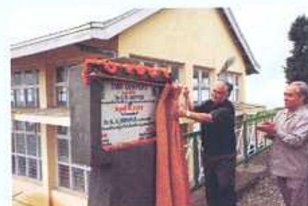
Inauguration of Fagu complex by ASRB Chairman