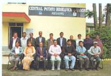
Group D (Non-matric/Non-ITI) staff training at Shillong

Training of group D (Non-matric/Non-ITI) staff was conducted at CPRI, Shimla and all its regional stations located at Modipuram, Jalandhar, Patna, Gwalior, Kufri-Fagu, Ooty and Shillong during June, 2009. All the group D staff of Institute successfully completed this training.