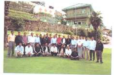
प्रशिक्षण में किसान

संस्थान में जुलाई व अगस्त माह में पश्चिम बंगाल के 56 प्रगतिशील किसानों के लिए दो-दो दिवसीय प्रशिक्षण शिविर का आयोजन किया गया। यह प्रशिक्षण 28-28 किसानों के दो समूहों में किया गया। यह प्रशिक्षण शिविर विशेषकर आलू के विधायन से जुड़ी जानकारियों पर केन्द्रित था। इस दौरान किसानों को संस्थान में कार्यरत