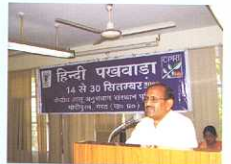
मोदीपुरम परिसर में हिन्दी पखवाड़ा

संस्थान के मोदीपुरम परिसर में हिन्दी पखवाड़ा का उत्साह देखते ही बना। हर वर्ग के अधिकारियों और कर्मचारियों की भागीदारी इस आयोजन को सफल बनाने में अहम भूमिका रही। परिसर के संयुक्त निदेशक महोदय ने 14 सितम्बर, 2009 को हिन्दी पखवाड़ा का शुभारंभ किया। पन्द्रह दिन चलने वाले इस कार्यक्रम में अलग-अलग दिन अलग-अलग हिन्दी प्रतियोगिताओं का आयोजन किया गया।