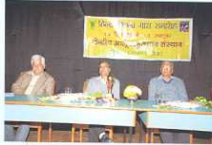
हिन्दी चेतना मास का समापन समारोह

एक माह तक चलने वाले इस कार्यक्रम के दौरान हिन्दी निबन्ध, नोटिंग एवं ड्राफ्टिंग, हिन्दी टाइपिंग, प्रश्नमंच, स्मरण शक्ति, चित्र कहानी और वैज्ञानिक लेख-लेखन जैसी प्रतियोगिताओं का आयोजन किया गया।