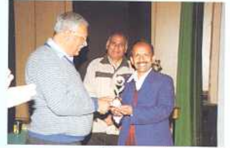
पुरस्कार वितरण समारोह

माननीय संसदीय राजभाषा समिति ने 30 अक्तूबर, 2009 को संस्थान के मुख्यालय में राजभाषा कार्यों का निरीक्षण किया। उन्होंने संस्थान के क्रिया-कलापों और आलू के प्रति विशेष रूचि दिखाई। स्थानीय रेडीसन होटल में आयोजित इस निरीक्षण कार्यक्रम के संयोजक थे सांसद डा. प्रसन्न कुमार पाटसाणी तथा श्री किशन वी. पटेल सांसद (लोकसभा)। उन्होंने जहां संस्थान के कार्यों की सराहना की वहीं हिन्दी