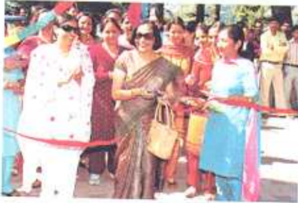
संस्थान में दीपावली मेले का आयोजन

के कई स्टाल रहे। पुरुषों के लिए आयोजित दोपहिया वाहन प्रतियोगिता ने विशेष रूप से आकर्षित किया।