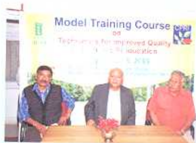
मॉडल प्रशिक्षण पाठ्यक्रम का आयोजन

केन्द्रीय आलू अनुसंधान संस्थान, शिमला में 18-25 अगस्त, 2009 के दौरान 'सुधरी तकनीक द्वारा बीज आलू उत्पादन' पर 8 दिवसीय मॉडल प्रशिक्षण पाठ्यक्रम का आयोजन किया गया। यह पाठ्यक्रम विशेष रूप से हिमाचल प्रदेश में कार्यरत बागवानी विकास अधिकारियों व आलू विकास से संबंधित अधिकारियों के लिए आयोजित किया जाता है। इस प्रशिक्षण पाठ्यक्रम में उत्तरांचल, पश्चिम-बंगाल, उत्तर प्रदेश, मणिपुर, हरियाणा, मेघालय व हिमाचल प्रदेश जैसे 7 प्रदेशों के 14 अधिकारियों ने भाग लिया। इस प्रशिक्षण में बंगलादेश के दो वैज्ञानिकों ने भी भाग लिया। प्रशिक्षण के दौरान 16 लैक्चर व 8 प्रैक्टिकल के जरिए प्रतिभागियों को आलू से संबंधित हर विषय की जानकारी दी गई। इसके साथ इन अधिकारियों को खेत-भ्रमण द्वारा भी प्रत्यक्ष रूप से आलू खेती कार्यों व रोग एवं उनके उपचार संबंधी विषयों की जानकारी भी दी गई। इस अवसर पर प्रतिभागियों को संस्थान द्वारा प्रकाशित विभिन्न तकनीकी पुस्तकें भी उपलब्ध करवाई गईं। पाठ्यक्रम से पहले व बाद में प्रश्नोत्तरी द्वारा अधिकारियों का मूल्यांकन किया गया। इस प्रकार जांचने