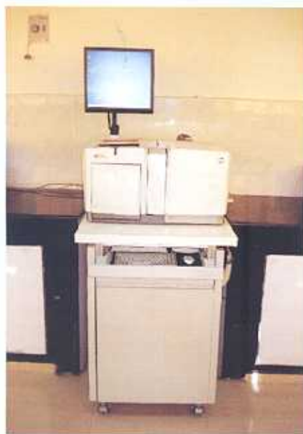
DNA sequencer installed at CPRI

and in 2008, the consortium initiated sequencing of the doubled monoploid S. phureja (DM1-3 516R44) potato derived from a diploid landrace of potato in order to simplify and complement the RH effort. In June 2009, PGSC members came together in Carlow, Ireland to plan the final phases of the project.