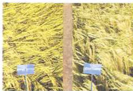
Control of neck blast by bioagent B-5

No Indian rice variety is resistant to neck rot caused by Pyricularia grisea and the fungicides available provide only reduction in disease severity and not the control. Root dip of rice seedlings for 20 minutes @ 0.25 % suspension of Bio-B5 at the time of transplant followed by a spray after a month of crop age was highly