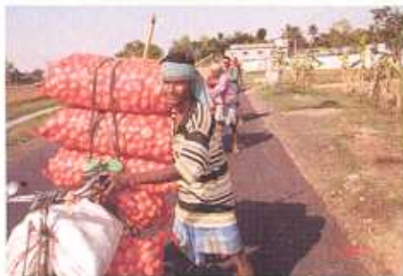
Common mode of transport of potatoes from the field to the cold stores and nearby markets

Post harvest losses are high in West Bengal some time even reaching to nearly 27% of the produce. These losses occur at different stages of handling, transportation, storage, processing and distribution. In West Bengal since no haulm cutting is done, uncured and immature tubers with soil sticking on them are mostly stored resulting in high magnitude of losses. Immediate storage from high temperatures to low temperatures in the stores also causes physiological break down of the tubers. A big problem in West Bengal is that potatoes are neither sorted nor graded before their storage by the farmers and these un-graded potatoes are used for sale/purchase both by wholesalers and retailers. Use of old gunny bags and stacking of bags one above the other up to the top in cold stores leaving a very