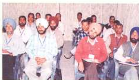
Trainees of the training programme

A "Trainers' training" was organized for the officials of National Seed Corporation (NSC), Central Integrated Pest Management Centre (CIPMC) Jalandhar and Deptt. of Horticulture,