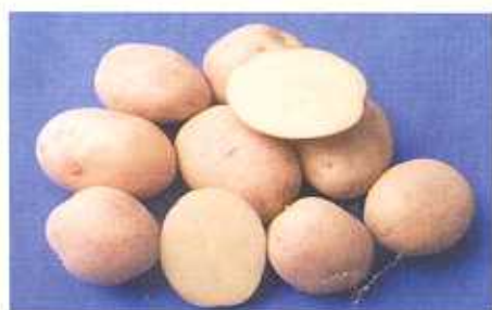
Tubers of Kufri Himsona

Central Potato Research Institute has developed a hybrid, viz. , MP/97-644, which produces higher total and processing grade tuber yields with excellent white colour chips. Compared