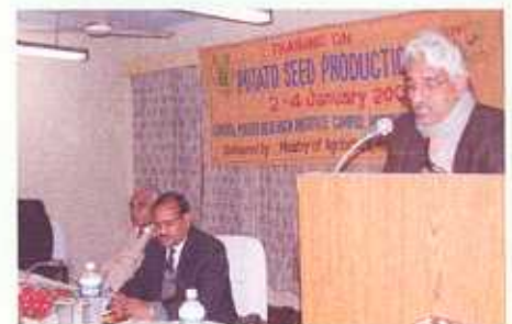
Inauguration of the training programme

A three days training course on potato seed production technologies was organized from 2-4 January, 2007. This training course was sponsored by Ministry of Agriculture, Govt. of India and aimed at promoting quality seed production in the country.