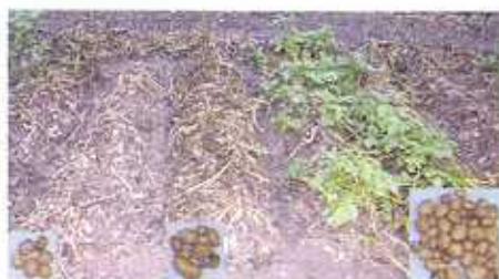
Katahdin Kufri Jyoti SP 951

Late blight is a major threat to potato cultivation. Potato varieties bred for resistance quickly succumb to newly evolved races of the pathogen. Incorporation of durable resistance in potato varieties would minimize the problem of resistance break down. The diploid potato species, S. bulbocastanum possesses high level of durable resistance to late blight. However, this source of durable resistance could not be utilized, so far, by classical breeding because of differences in ploidy and Endosperm Balance Number (EBN). Recently, the RB gene responsible for race non-specific, broad-spectrum resistance in S. bulbocastanum has been cloned by Prof. John Helgeson and his group at the University of Wisconsin, Madison, USA. The RB gene technology has been made available to India by the Agricultural Biotechnology Support Project II of the Cornell University, USA. Transgenic lines of the US potato cultivar Katahdin were evaluated under Indian condition and they performed very well under intense late blight pressure.