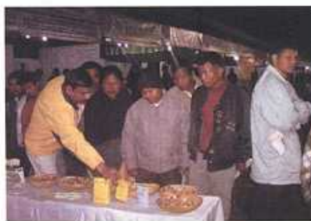
CPRS Stall during NE Agri. Fair

The North East Agri Fair and National Seminar on Extension Strategies for Optimizing Agricultural Production and Entrepreneurship Development in NE Region were organised at ICAR Research Complex for NEH Region, Umiam, Meghalaya on 5 th - 7 th March, 2007. CPRS, Shillong participated in the fair with a good response from visitors especially from