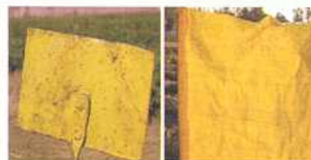
Photograph of small and big yellow trap

Potato crop is attacked by Aphis gossypii Glover, commonly known as melon aphid or cotton aphid, which is polyphagous in nature. This aphid completes its life cycle on different hosts like tomato, brinjal, cucurbits, weeds (like bharg , chenopodium , parthenium , etc.) and is found throughout the year on one crop or the other. This aphid is very hardy and effectively transmits potyviruses, although it is only one of dozens of species implicated in the spread of plant viruses. This fact of vectoring diseases made this aphid more important and calls for its early and effective detection and management on potato crop. It attacks both early (Mid-September planted) as