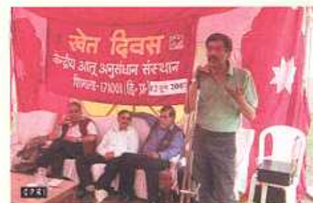
खेत दिवस का आयोजन

यह खेत दिवस संस्थान द्वारा खड़ापत्थर क्षेत्र के 12 किसानों को वर्ष 2007 के दौरान अपनाये जाने के उपलक्ष्य में आयोजित किया गया था। इस खेत दिवस में खड़ापत्थर एवं अन्य क्षेत्रों से लगभग 150 किसानों ने भाग लिया।