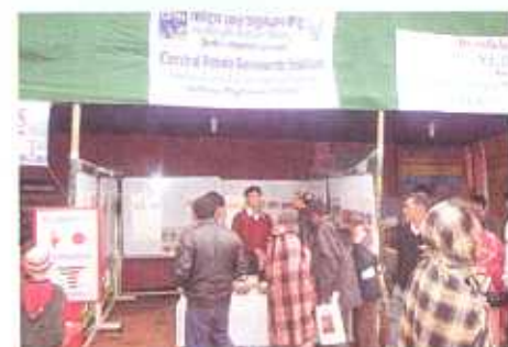
Farmers visiting CPRS, Shillong stall