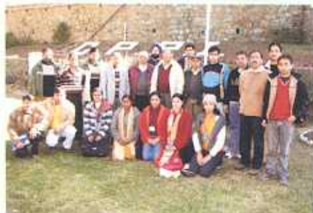
Participants of the workshop

CPRI, Shimla collaborated with Sophisticated Analytical Instrumenta-