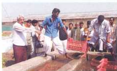
Demonstration of seed treatment