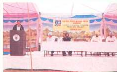
Inauguration of the farmers training

A "Farmers training" was organized on 24 th March 2007 at CPRS, Jalandhar. About 300 farmers from different parts of Punjab participated in the training programme to acquire knowledge about the improved technologies of potato production. To get the feedback progressive farmers representatives were allowed to present their views. Functioning of the laser leveler was also demonstrated on this occasion.