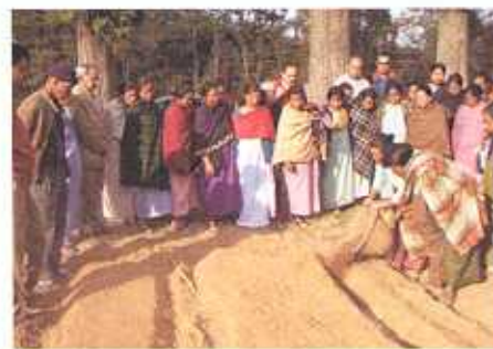
Hands-on Training for the farmers

A two days' Farmers' Training on "Improved Potato Production Techniques" was held at Central Potato Research Station, Shillong from 26 th -27 th March, 2007 under Mini Mission-I. All together 50 farmers participated in the training programme from different villages, viz., Sanmer, Baniun, Mawklot and Nongpiur. Potato is one of the major crop of Meghalaya. It is well integrated