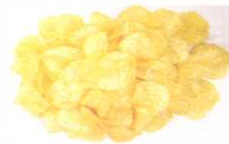
Chips made from the tubers of cv. Kufri Himsona

to Kufri Jyoti and all the Indian and exotic potato processing cultivars, when grown in hills this hybrid has the best processing quality. The hybrid has established its superiority over the existing cultivars when tested at Kufri, Shimla, Mandi, Almora, Shillong and Ooty hills. The hybrid has also been tested for its chip making quality on the commercial industrial line and has been adjudged best among all other varieties being grown or tested in the hills. The tubers of the hybrid are oval shaped, shallow eyed with creamy flesh. The hybrid has shown very high degree of resistance to late blight in all the potato growing areas in hills where the disease appears every year in the epidemic form. The hybrid was released as variety Kufri Himsona for the hills of HP by HP State Variety Release Committee. The availability of this variety will be a boon for processing industry as it will fill up the gap of providing potatoes for processing during lean period and will provide extra money to the farmers because of higher total and processing grade tuber yields in this variety. Further, the farmer will save on money also by applying lesser number of fungicide sprays against late blight. It is expected that with the cultivation of this variety and production of potatoes for processing from hills, the potato processing industry, especially situated in north-western plains, will further grow due to year round availability of quality raw material.