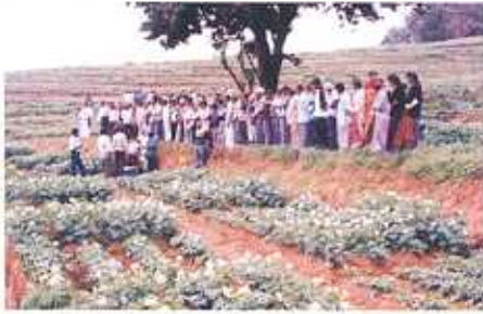
Farmers in potato field

13 private companies dealing with fungicides, pesticides, tractors and organics exhibited their products. This was a one day programme.