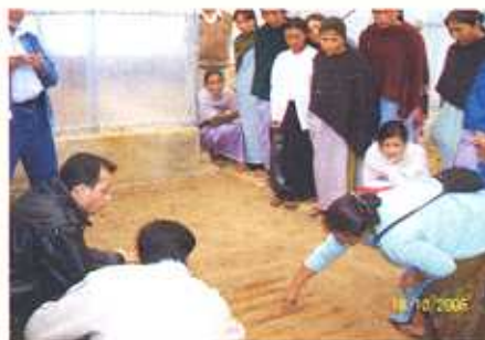
Training on TPS technology to Farmers