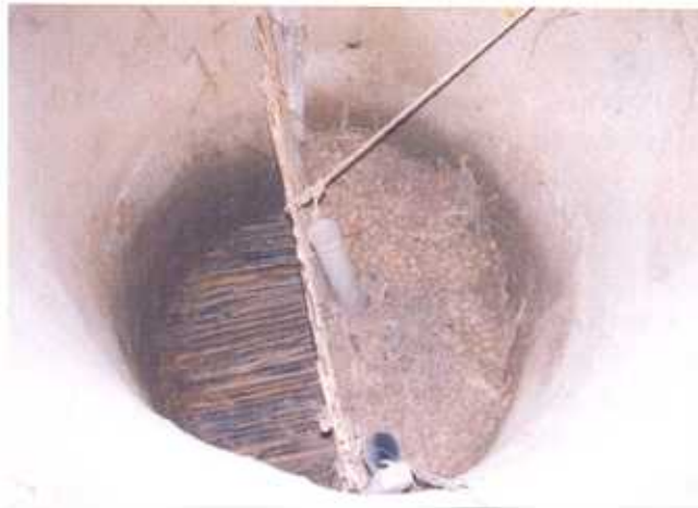
Fig. 3. Base structure of pit