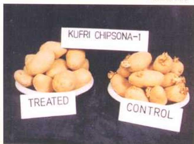
Fig. 7. Sprout suppression with CIPC spray in pit

The efficiency of CIPC spray treatment is more pronounced under pit storage where complete sprout inhibition can be achieved up to 105 days of storage (Fig. 7). Total losses in treated potatoes are significantly reduced under pit storage (2.9-5.3%) as compared to heaps (6.1-10.6%). There is no need to desprout the tubers before sending them to the market in case of spray application and the labour used for desprouting in fog application is also significantly reduced. The treated potatoes appear very firm and fetch market rates better than the control (untreated) potatoes stored under respective conditions.