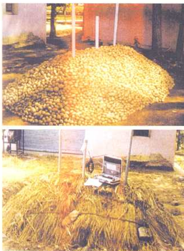
Fig. 1. An uncovered and a covered potato heap fitted with temperature-humidity recorder

Construction cost of pucca pit is about Rs 2500/ tonne with a life span of 50 years. Proper aeration of heaps and pits in particular is essential. Providing a platform made of bamboo sticks tied at 5 cm spacing at about 60 cm above the base (Fig. 3) and placing perforated PVC pipes in bulk stored potatoes in pits increases ventilation and significantly reduces the rottage. A thatched roof over the heaps and pits helps to further reduce the temperature and protects the stored potatoes from rain water.