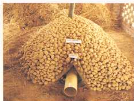
Fig. 2. A potato heap with triangular or tubular basal ventilator

The size of the heap can vary depending upon the quantity of potatoes stored but the height of the heap should not be more than 1.5 m. Placement of perforated PVC pipes in the centre of potato heap helps in the removal of carbon dioxide accumulated due to respiration during storage (Fig. 1). To enhance ventilation to bigger heaps, basal ventilators need to be placed under the potato piles. Basal ventilators can be triangular or square duct made of wooden