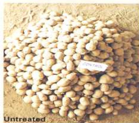
Fig. 6 Sprout suppression in potatoes with CIPC fog and spray in comparison to control (untreated) after 90 days of storage in heaps