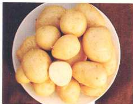
Tubers of JW 96

JW 96 was approved for registration (Indian Germplasm Registration Number INGR No. 05023; National Identity IC 524019) as a line for earliness in XIV Germplasm Registration Committee Meeting, 2005. JW 96 possesses good general combining ability for yield at very early (60 days) and early (75 days) harvests. Under early (75 days) harvest, this germplasm accession yielded at par with best control Kufri Ashoka in Indian plains and plateau region under multi-location trials of All India Coordinated Potato Improvement Project from 1997-1998 to 2001-2002. JW 96 is a selection from the progeny of the cross Kufri Jyoti × CP 1362. The clone was selected from the progeny of this cross at Central Potato Research Station Jalandhar, Punjab.