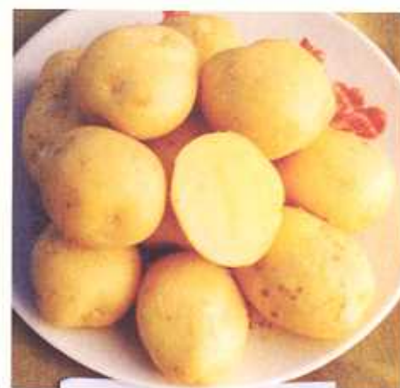
Tubers of JX 123

JX 123 is high yielding under early (75 days) harvest and has good general combining ability for yield at very early (60 days) and early (75 days) harvests. This line performed well for yield under early (75 days) harvest in Indian plains and plateau region. Under early (75 days) harvest, this accession gave yield at par with best early maturing variety Kufri Ashoka in Indian plains and plateau region under multi-location trials of All India Coordinated Potato Improvement Project from