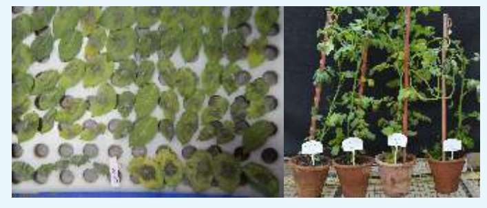
Screening of hybrids for late blight resistance

Nine advanced potato hybrids along with three check varieties were screened for late blight, viruses and